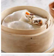
水晶素蒸饺 Crystal Mushroom Dumpling 5.80