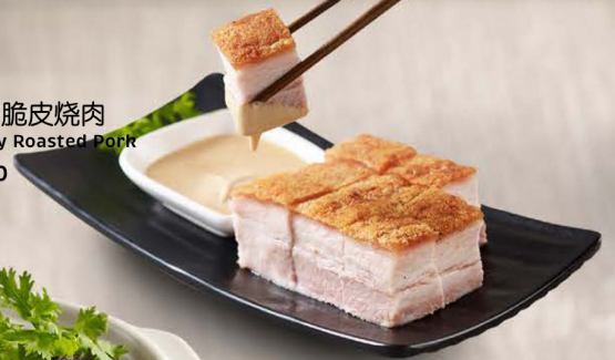
金砖脆皮烧肉 Crispy Roasted Pork 19.80