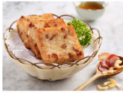
腊味萝卜糕 Fried Carrot Cake 7.00