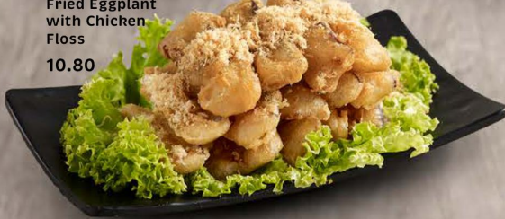
肉松茄子 Fried Eggplant with Chicken Floss 10.80