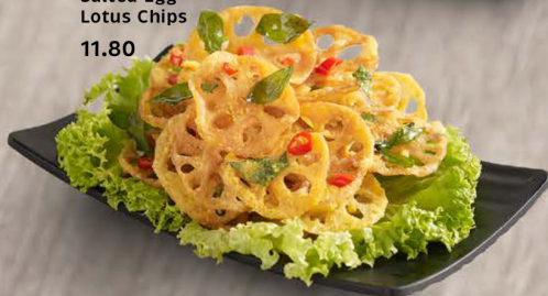
咸蛋脆莲藕 Salted Egg Lotus Chips 11.80