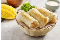
芝麻香芒筒 Prawn & Mango Sesame Fritters 7.00