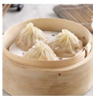
灌汤小笼包 Xiao Long Bao 6.80