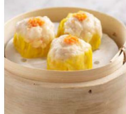
鱼子蒸烧卖 Fish Roe Siew Mai 6.80