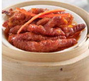
桂林酱凤爪 Phoenix Claw (Chicken Claw) 7.00