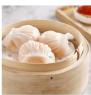
饮茶虾饺皇 Yum Cha Prawn Dumpling 7.00