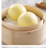
流沙奶皇包 Salted Egg Custard Bao 6.00