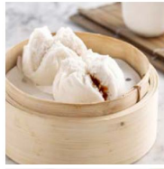
蚝皇叉烧包 BBQ Pork Bao 5.80