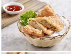
煎肉饼 Fried Pork Pancake - Prata Style 7.80