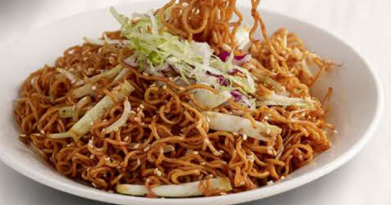
豉油皇炒面 Hong Kong Soya Noodles (Dry) 9.80