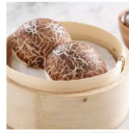
松露花菇包 Truffle Mushroom Bao 5.80