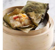
荷叶糯米鸡 Lotus Leaf Glutinous Rice 6.80