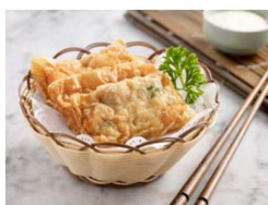
鲜虾腐皮卷 Deep Fried Prawn Beancurd Roll 7.00