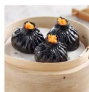
顺鼓墨鱼饺 Squid Ink Dumpling 6.80