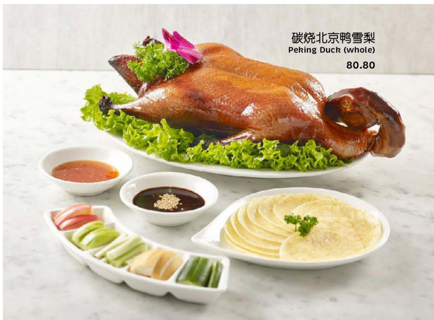
碳烧北京鸭雪梨 Peking Duck (whole) 80.80