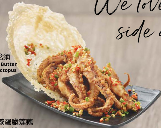
牛油龙须 Golden Butter Fried Octopus 18.80