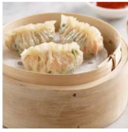
香茜鲜虾饺 Coriander Prawn Dumpling 6.00